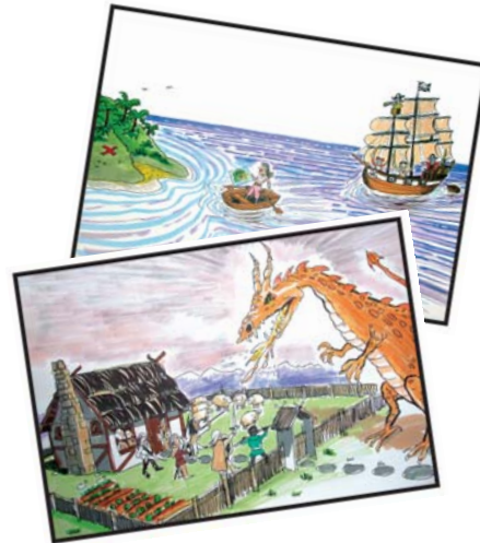
Single Picture Stimuli

The Oral Narrative Assessment Package provides wordless picture book and single picture stimuli to gather narrative samples from preschool and school aged children. Story samples can be gathered spontaneously or as retell tasks which are part of the kit. Story comprehension questions are also included for each of the wordless picture books. Guidelines for analysis encompass both macrostructure and microstructure elements in an easy to record format, which supports the speech pathologist to consider the important components of successful oral narrative construction. Pictures are engaging and interesting to children of a range of ages. Normative data is not included however analysis is guided by the work of Carol Westby and Natalie Hedberg* with approximate ages aligned with Stein & Glenn's** story grammar analysis.